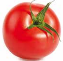
2D relative abundance plot of sulfur on a tomato