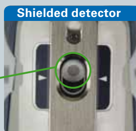
Undamaged detector when fitted with TITAN Detector Shield