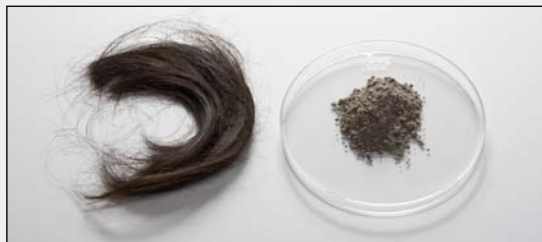
Hair sample before and after grinding with the FRITSCH PULVERISETTE 23

For fast and simple preparation of hair samples for analysis for drug traces, roughly 300-500 mg of hair can be ground to a fine powder (< 100 µm) in just 5 minutes in the FRITSCH Mini-Mill PULVERISETTE 23 using a 15 mm steel ball in a 15 ml steel bowl.