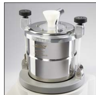
FRITSCH cryo-box for fast, simple embrittlement

The FRITSCH PULVERISETTE 0 is the ideal laboratory mill for fine comminution of medium-hard, brittle, moist or temperature-sensitive samples – dry or in suspension – as well as for homogenising of emulsions and pastes.