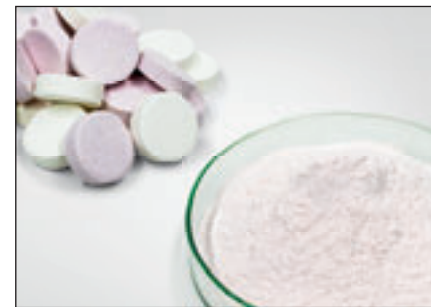
Cookies and vitamin tablets before and after comminution in the Knife Mill PULVERISETTE 11