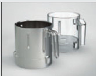
Grinding vessels 1.4 litre