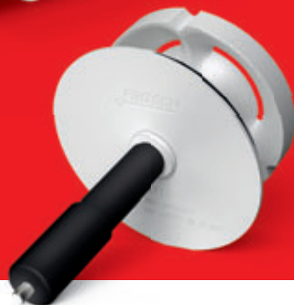
Vario-Lid system with plunger made of plastic PP and reduction sample pusher for moist, liquid and viscous sample materials.

The freely adjustable Vario-Lid system made of plastic PP fulfils two important requirements at the same time: It can be used to reduce the grinding chamber volume down to 0.54 litre and to manually compress and loosen up the sample material at the beginning and at any time during comminution. Thus you always achieve a homogeneous sample in a narrow particle size range even for smaller sample quantities and for difficult-to-grind materials. The Vario-Lid system is delivered as a standard with a reduction sample pusher for moist, liquid and viscous sample materials such as tomatoes, cucumbers or yoghurt. It automatically returns rising liquids during the comminution and can be used for most sample materials. A reduction sample pusher can be ordered as an option for dry, solid samples.