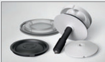
Lids for grinding vessels