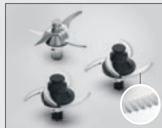
Different knives with 4 blades