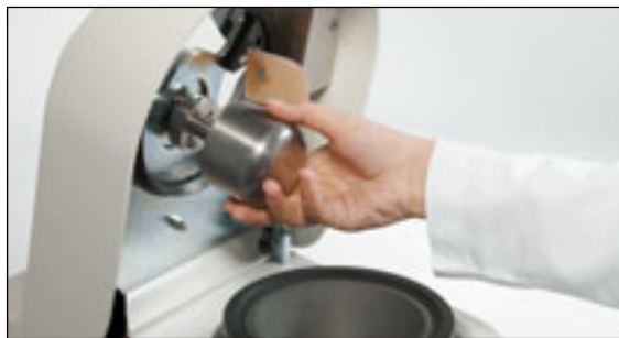
Practical inserting of the pestle without tools – for quick work and easy cleaning