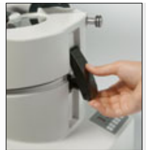
Automatic safety switch-off when opened