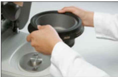
Easy to handle and extremely safe: quick-fastening bayonet clamping of the mortar bowl