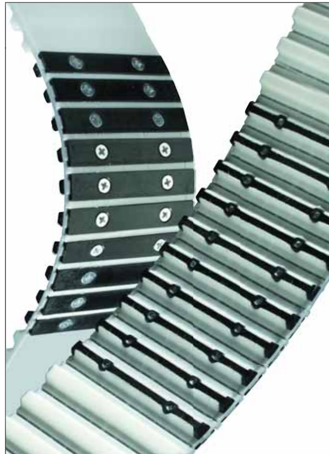
AT10 DC / T10 DC timing belt lock