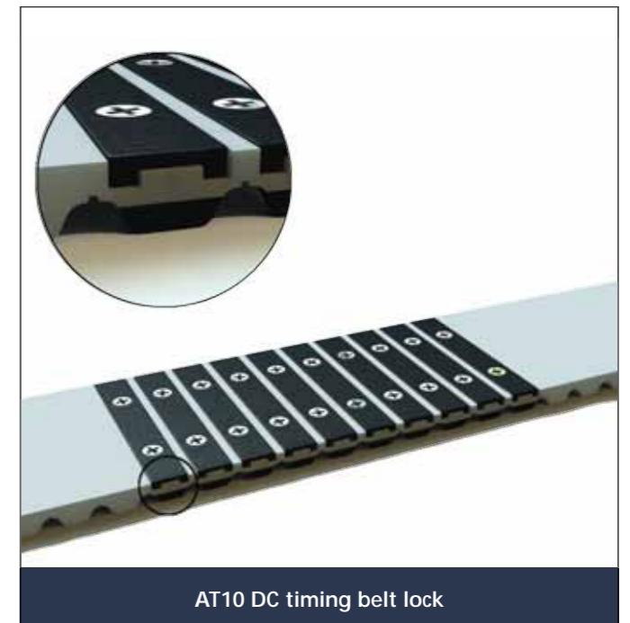
AT10 DC timing belt lock

Specify the two respective designations when ordering the timing belt and the lock. If only the timing belt designation is specified, only the timing belt will be supplied with the respective preparation for the lock.